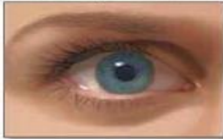
Normal, clear lens